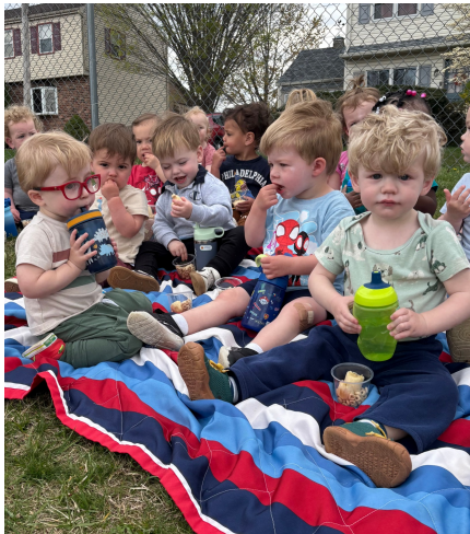
Eating snack outside!

This month we also get to celebrate mothers! The women that kiss our boo-boos better and make us smile everyday. Let's make sure we show them how much they are loved and appreciated.