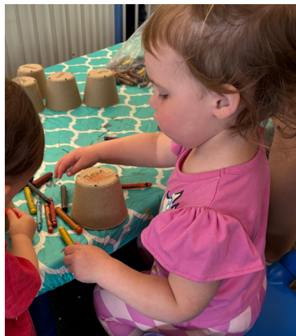
Working on an art project!