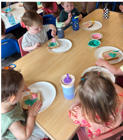
Making rainbow bread