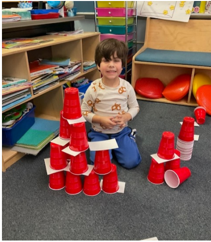
Honey Bears read Cat in the Hat. They did a stem building activity.