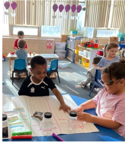
Science Exploration- What is dirt, water, and air? They sorted the pictures that went with each item.