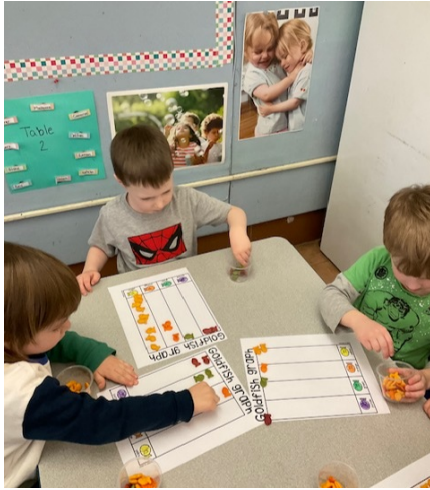
Honey Bears are having fun at snack time sorting colored goldfish.