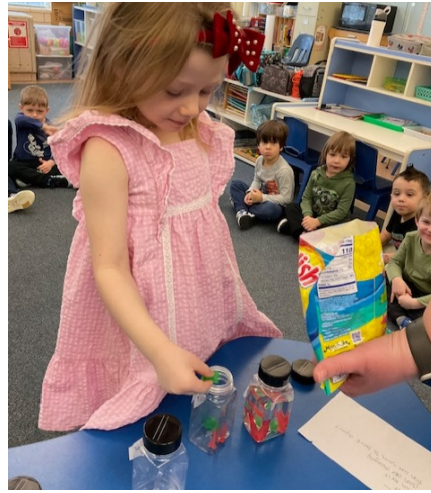
Honey Bears read One Fish, Two Fish, Red Fish, Blue Fish. We placed candy fish in water, vinegar, coffee, and oil to see what happened to the fish over 24 hours.