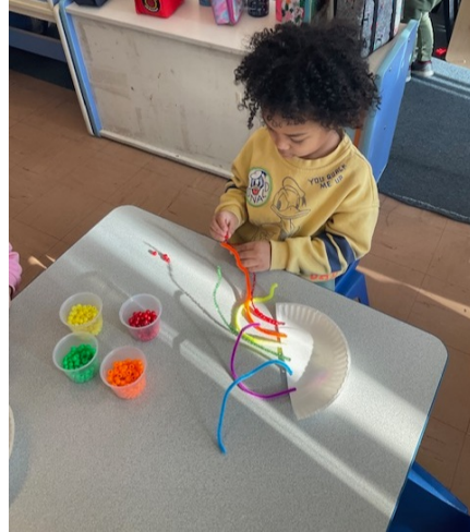
Honey Bears are using their fine motor skills to bead the color of the rainbow.