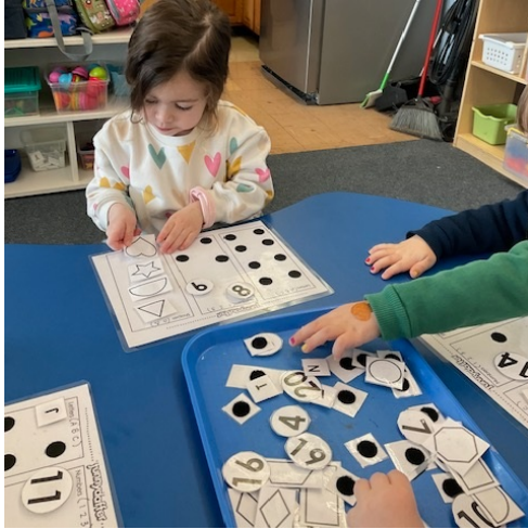
Honey Bears are sorting letters, number, and shapes.

Hello families! Thank you to whom ever brought items in for our Valentine's Party, the kids had a blast. Thank you to whom ever donated to our food drive community service project. It is almost spring and we have been working hard academically. All the students have grown so much since September and I'm excited to see how the rest of the school year turns out.