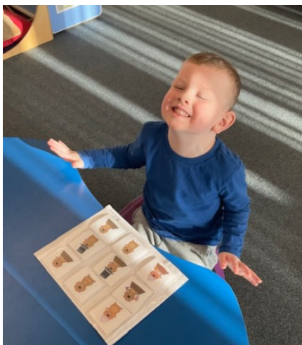
Honey Bears are matching the groundhog to its shadow.

We have been practicing our address and will continue to do so throughout the rest of the year