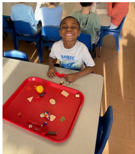
Honey Bears investigated what items were magnetized and what items were not.