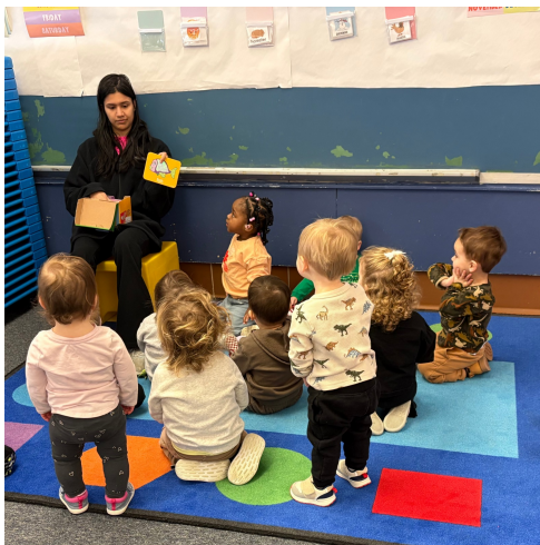
Some of Our Favorite Moments

We will celebrate St Patrick's day as well with a party and "wear green day!! Another sign-up genius will go out for that as well as a sign-up genius for conferences. The sign-up genius for conferences will go out the week of the 9th so please let me know if you cannot access it for some reason or the invitation doesn't get to you!