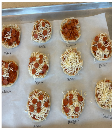
we had so much fun making our pizzas