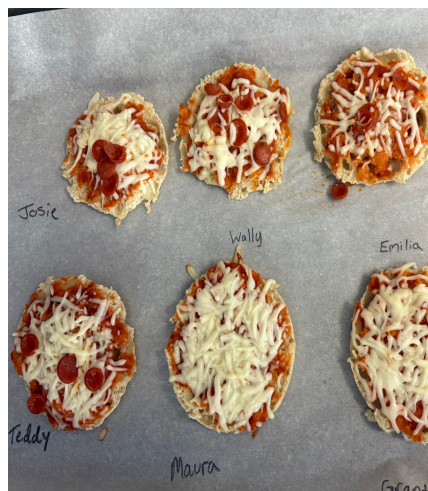
for national pizza day!