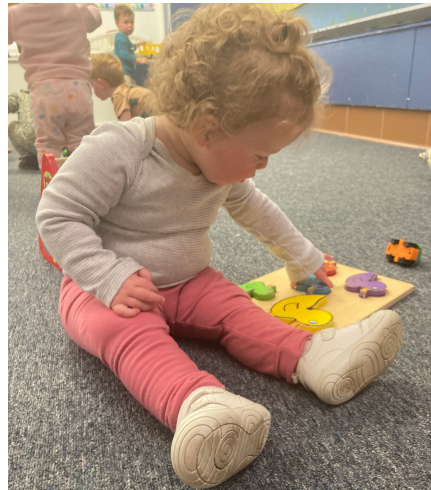
Hunting for eggs