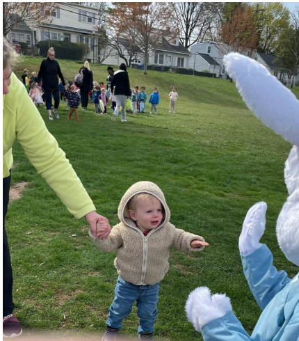
Easter Bunny fun!