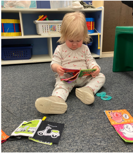
Reading some books