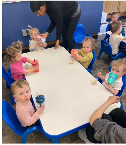
Having some apples for snack!