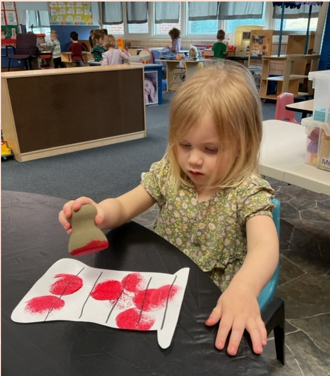
Last month, the Gummi Bears celebrated Dr Seuss. We painted a Dr. Seuss Hat.