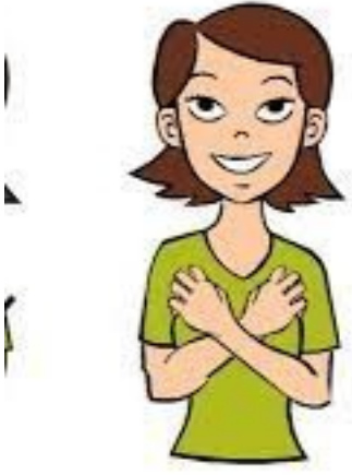
Sign language for "bear"