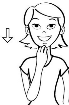
Sign language for "sleep"