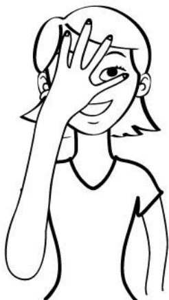
Sign language for "sleep"